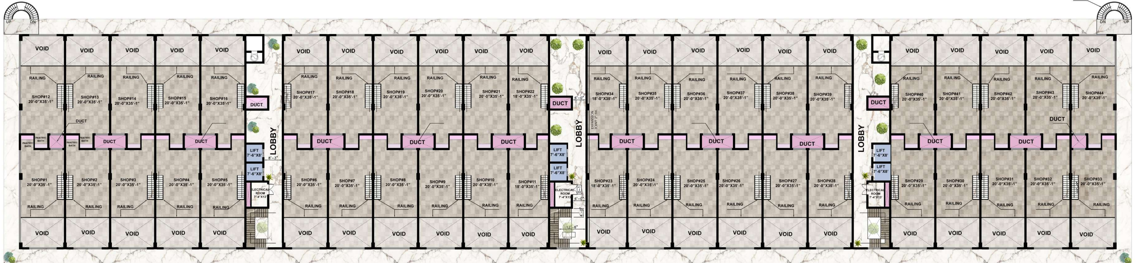
MEZZANINE FLOOR PLAN 35501.4 SFT