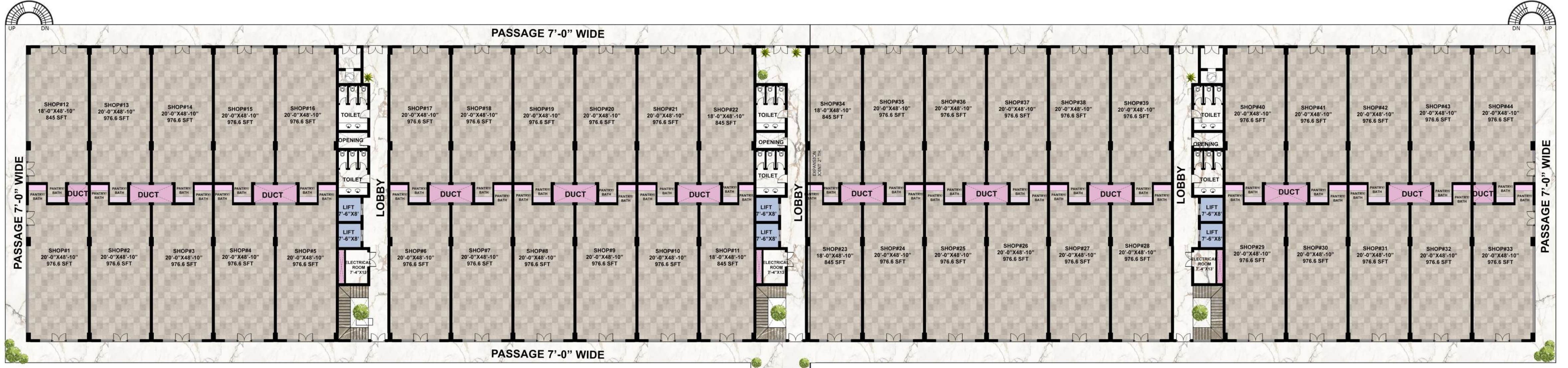
FIRST FLOOR PLAN 58764 SFT